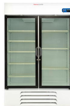
Thermo Scientific TSG Series 49 cu. ft. refrigerator.

a zero-waste-to-landfill facility, meaning more than 90% of the waste generated at our manufacturing site is diverted from landfills. Finally, the TSG Series refrigerators operate at 51 decibels, which is a similar noise level to a home conversation [3]; this allows them to be located conveniently inside the lab